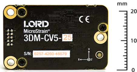
3DM-CV5™-25-miniature, industrial-grade attitude and heading reference system (AHRS) with integrated magnetometers, high noise immunity, and exceptional performance

The LORD Sensing 3DM-CV5 family of industrial-grade, board-level inertial sensors provides a wide range of triaxial inertial measurements and computed attitude and navigation solutions.